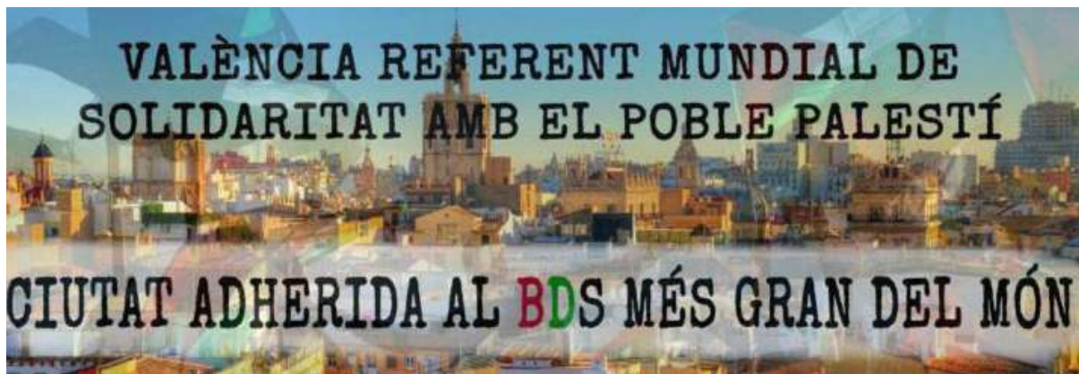
Graphic used by groups in the Spanish state after the approval of an AFZ motion in Valencia city council. The text in the image says: Valencia is a global referent for the solidarity with the Palestinian people. Biggest BDS city in the world.