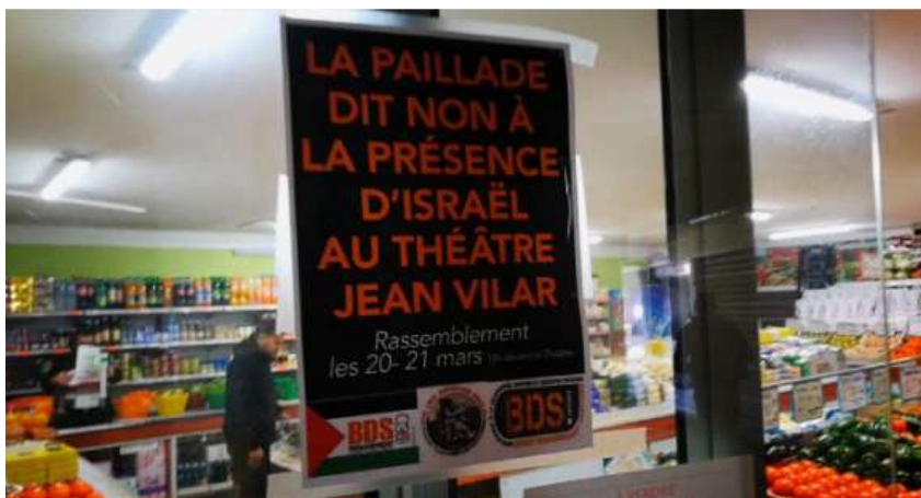
Picture of an AFZ action by BDS Montpellier in la Paillade, a neighborhood in Montpellier.

Local groups in Belgium are receiving support from and spreading AFZ among community organizations.