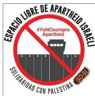
AFZ logo in the Spanish state