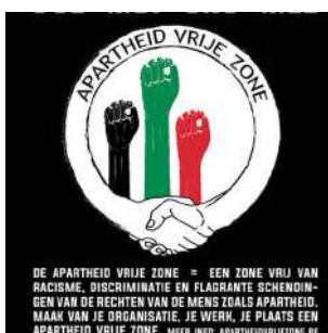
AFZ logo in Belgium