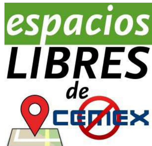
Image used by groups in Latin America for the Stop Cemex Campaign